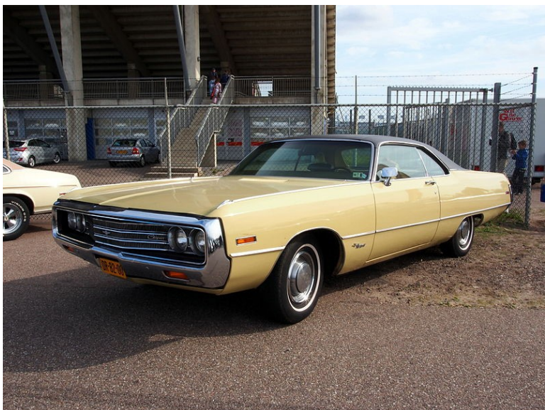
1971 Chrysler Newport two Door Hardtop

For the 1971 model year, the Royal came standard with the 255 hp (190 kW) 360 cu in (5.9 L) V8, with optional 275 hp (205 kW) or 300 hp (224 kW) 383 cu in (6.3 L) engines, but not the 440 cu in (7.2 L); the Custom was standard with the 275 hp (205 kW) 383 cu in (6.3 L) V8, and the 300 hp (224 kW) 383 cu in (6.3 L) or 335 hp (250 kW) 440 cu in (7.2 L) V8s as options. For 1972, the Royal came standard with the 190 hp (142 kW) 400 cu in (7.2 L) V8 with 190 hp (142 kW) engines unavailable, while the Custom was standard with the 190 hp (142 kW) 400 cu in (6.6 L) V8, and the 225 hp (168 kW) single- and 245 hp (183 kW) dual-exhaust 440 cu in (7.2 L) V8s were optional. Power output would steadily decrease on all engines during this generation due to stricter emissions standards and rising fuel prices.