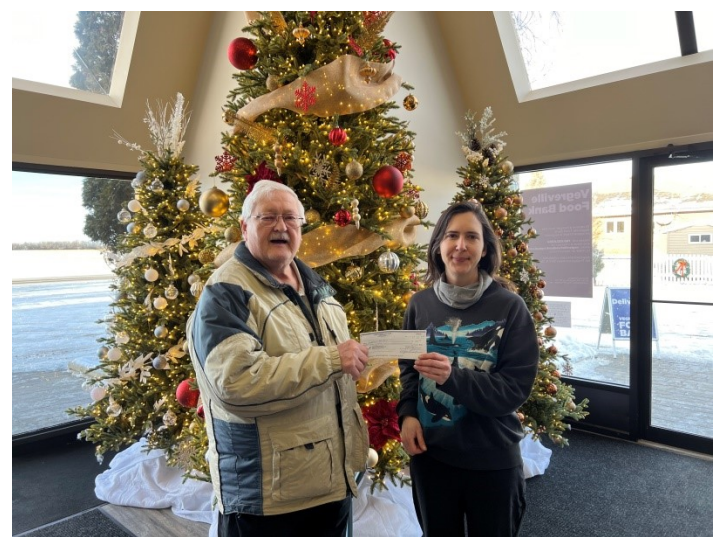
Cheque presentation of $500 to the Christmas Bureau.