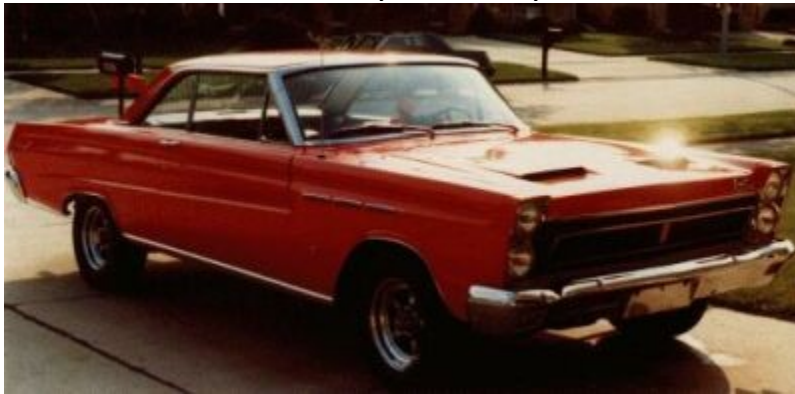
1965 Mercury Comet Cyclone

The Comet received a slight performance boost in 1965 as the 289 V8 was upgraded to 225 bhp. Though not technically available, some Comet's snuck out of the factory with the special order 289 V8 with 271 bhp and some even received the wild SOHC 427 V8.