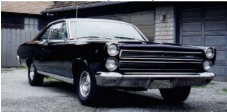
1966 Mercury Comet Cyclone

The Comet was all new for 1966 and shared its chassis and body shell with the Ford Fairlane , making it a true intermediate. Wheelbase grew to 116 inches, and front track was increased three inches to 58 inches, finally allowing room for big block engines. Styling was plain, though decent, and a convertible was added for the first time. Both body styles had standard bucket seats and console.