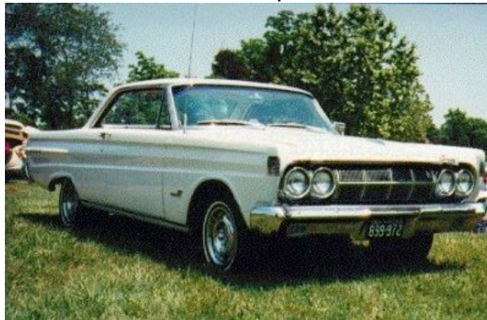
1964 Mercury Comet

The Mercury Comet was restyled for 1964 and got the Cyclone Super 289 V8 added to the option list. It was rated at 210 bhp. The Comet got a boost in its performance image when a fleet of Comet Caliente hardtops averaged more than 105 mph for 100,000 miles in Daytona. They had the high performance 289 V8 rated at 271 bhp which was not available in the production model. Specially built drag racing Comet's with 427 big blocks also were making some noise on the tracks. To capture some of this excitement, Mercury announced the Cyclone two-door hardtop in January of 1964. It came standard with bucket seats, console, wheel covers that looked like chrome wheels and chrome engine dress-ups for the 210 bhp 289 engine.