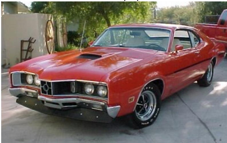
1970 Mercury Cyclone

Mercury restyled the Cyclone for 1970, though not for the better. The wheelbase grew an inch to 117 inches, but the overall length grew by 6.7 inches. The latter was due to a new protruding nose and fender design, that sported a gunsight-type design in the grille center. While its Ford Torino cousin got new fastback designs, Mercury intermediates did not, and also lost the convertible for its Montego series. The Cyclone hardtops had trunk lines about halfway between the old notchback hardtops and the fastbacks.