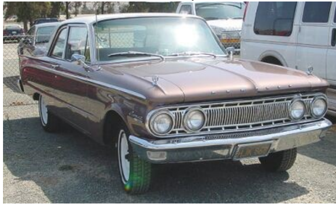
1962 Mercury Comet

The Comet officially became part of the Mercury line in 1962.