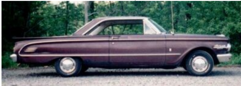
1963 Mercury Comet

The Comet received its first V8 (along with the Falcon) for 1963. There was room only for a small block and the first was a 260 cid V8 rated at 164 bhp.