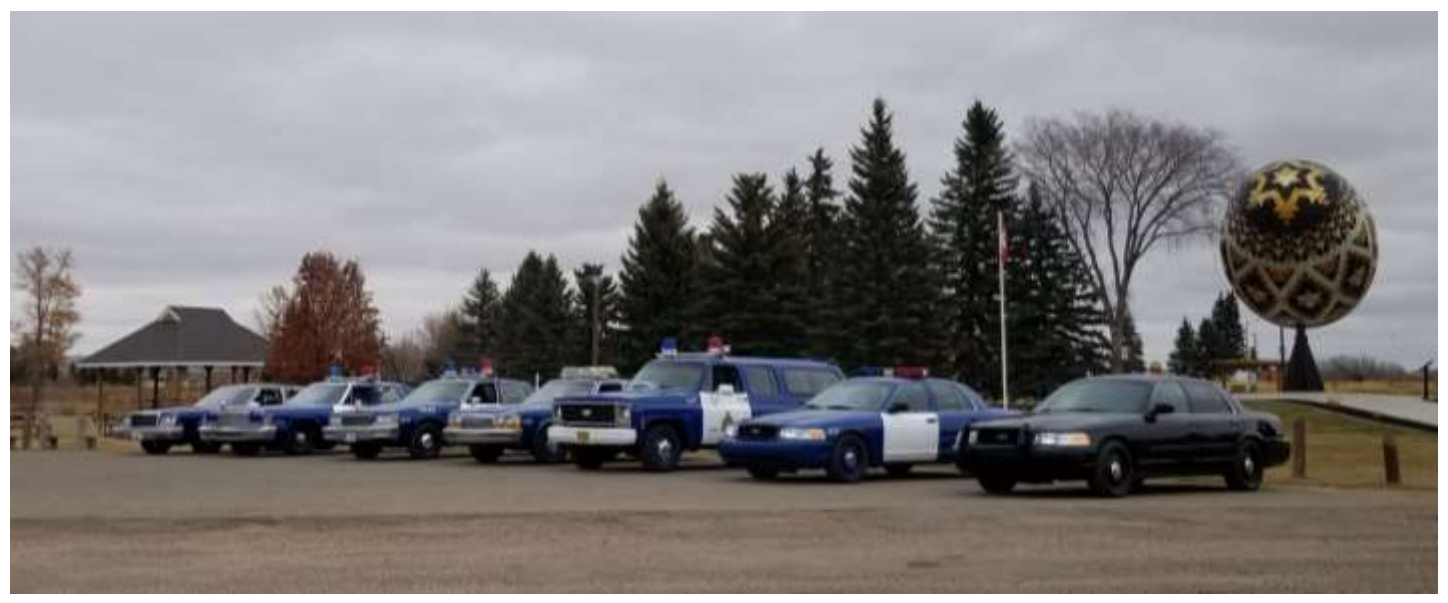
The world famous Pysanka erected to commemorate the RCMP is in the back ground.