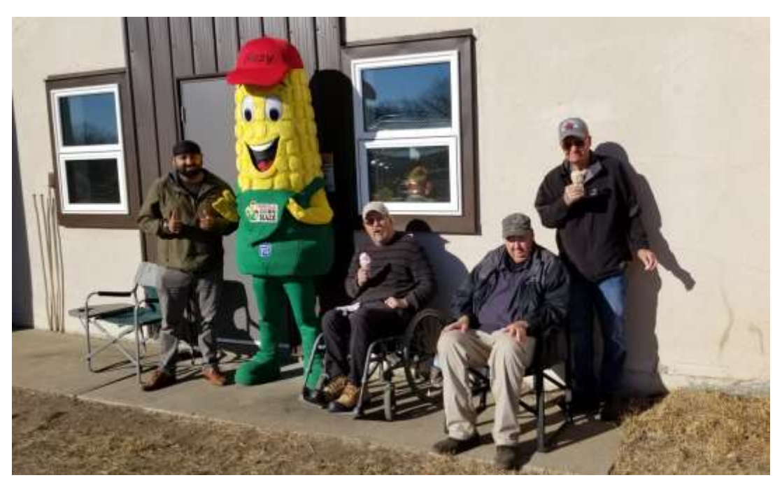
Some of our members relaxing out of the wind, enjoying ice cream from the Red Wagon. After the car show, our police car enthusiasts stopped at the local RCMP detachment building for a photo shoot opportunity. A few RCMP officers in and around Vegreville and St.