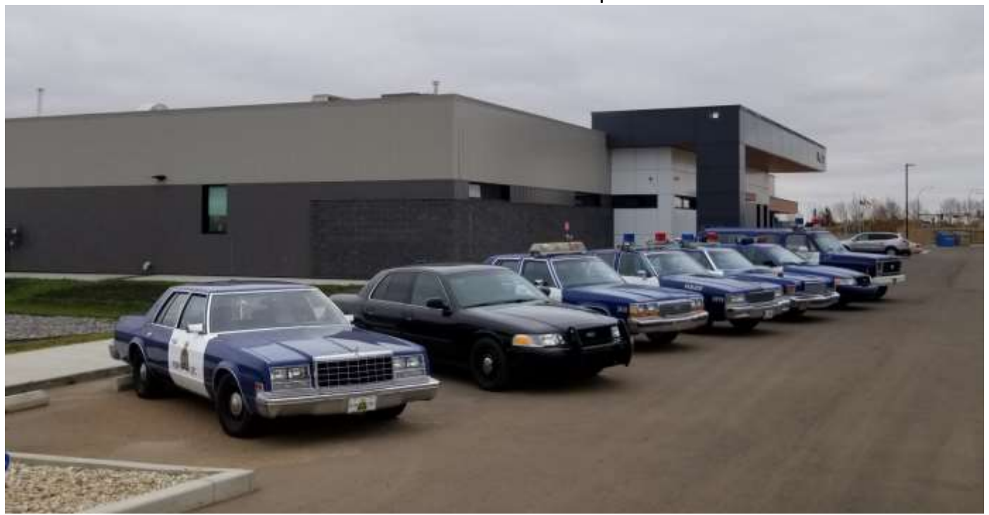
The participants lined their vehicles in front of the new RCMP headquarters in Vegreville.