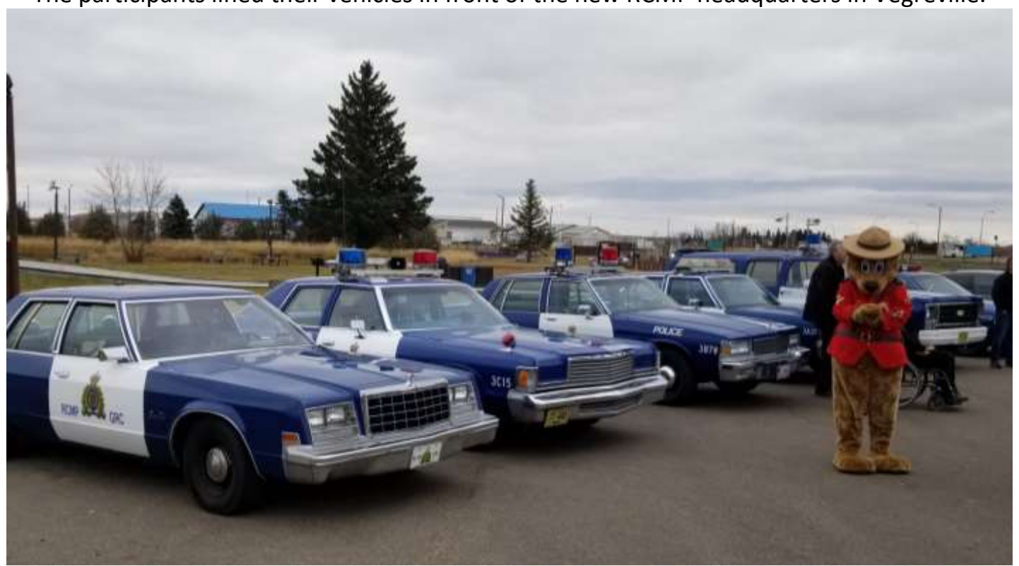
Lined up at the Elks and Kinsmen Park