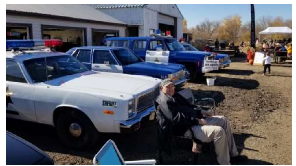
Many of our members are police car enthusiasts and are very popular with the attendees.