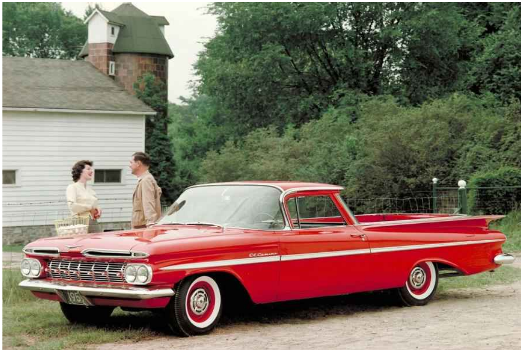
1959 Chevrolet El Camino (Robert Tate Collection)