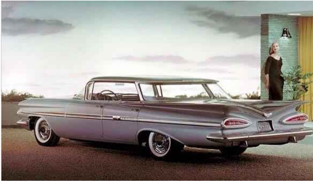
1959 Chevrolet ad illustration