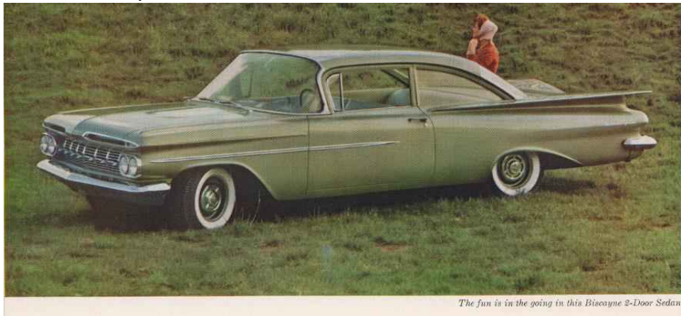
The fun is in the going in this Biscayne 2-Door Sedan.

In 1959, Chevrolet dropped the Delray nameplate, and the Biscayne became the new low-price model. The Bel Air series, which had been the top of the line nameplate since 1953, was now the middle-range series, and the Impala, which had been a sub-series in the Bel Air line in 1958, was now the top of the line model for Chevrolet.