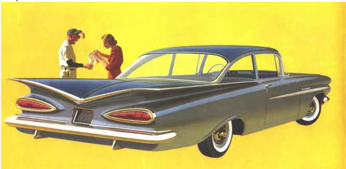
1959 Chevrolet Biscayne ad illustration

The American automotive industry had a fantastic sales year in 1959. It was a year that was highlighted by the late Dinah Shore and Pat Boone introducing the all-new 1959 Chevrolets in television advertising. It was also a year that Rock and Roll music continued to rise in popularity, with Frankie Avalon's hit song "Venus" starting a long run on the music charts in May.