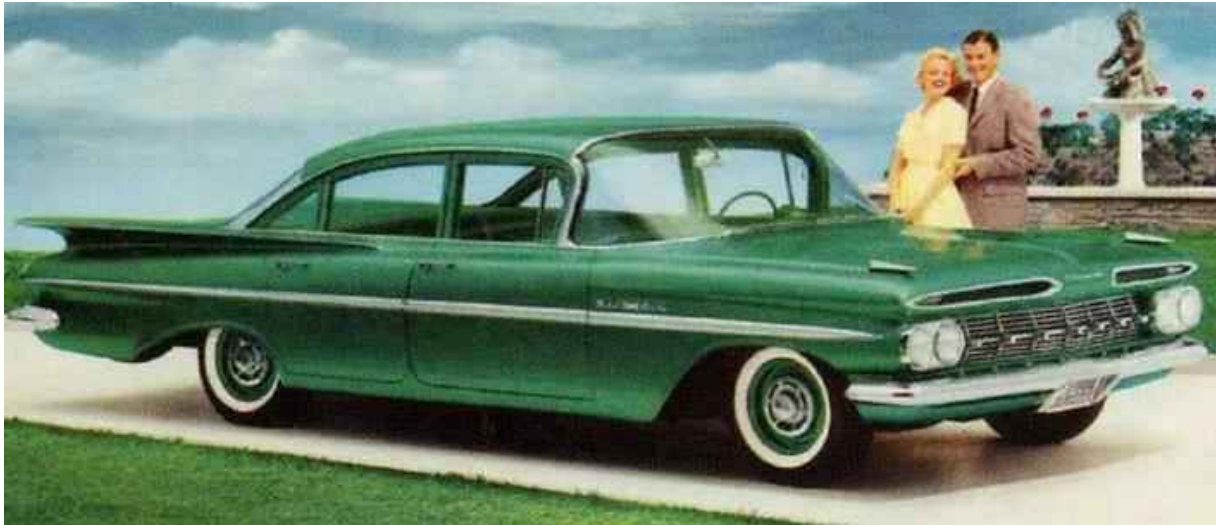
1959 Chevrolet ad illustration