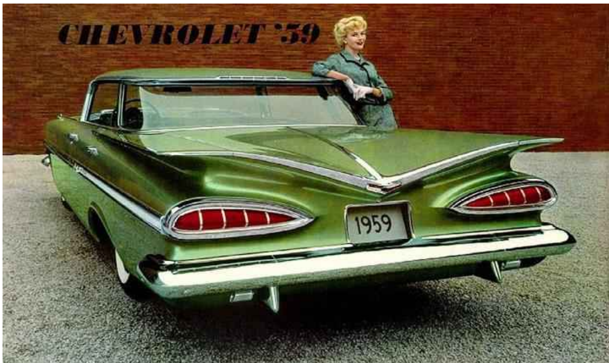
1959 Chevrolet ad illustration

General Motors introduced a new roof line design for Chevrolet in 1959. The overhanging rear roof design was called the Impala Sport Sedan. The model offered distinctive styling with a huge wrap-around rear window along and the overhanging roof design on the hardtop models. This popular roof design was also used on the Buick, Cadillac, Oldsmobile and Pontiac models for 1959 as well.