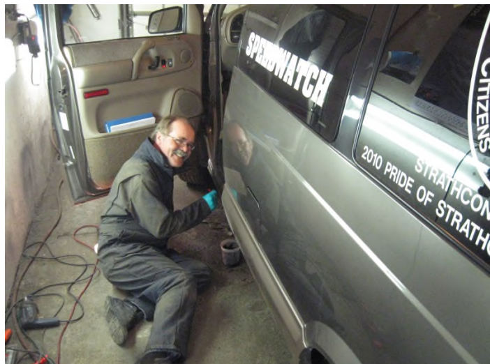
Del hard at work