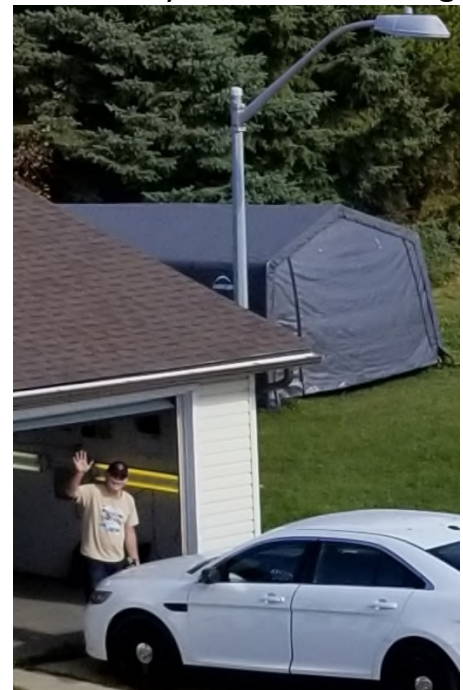
A COVID-19 wave from Del